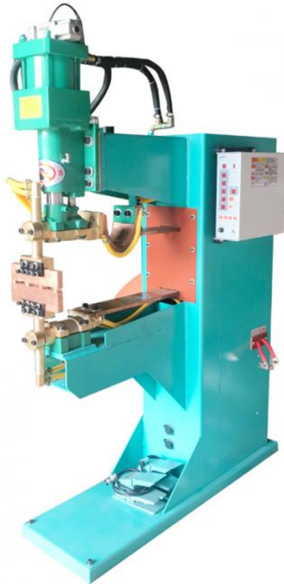
A corner of the spot welder warehouse