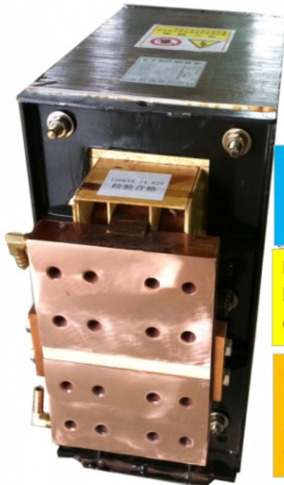
台湾水循环变压器 water circulation Taiwan transformer

All red copper water circulation control device of transformer, water-saving forced cooling, imported high-grade silicon steel, with long service life, high conductivity, low power consumption and strong current. And equipped with temperature control system, overheating and overload will automatically power off for protection.